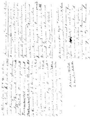
Folio 6r of the "History of Rome" MS British Library