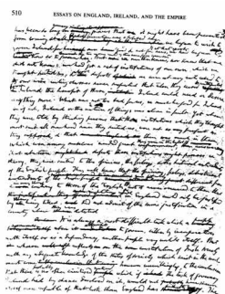
Folio 3r of draft of England and Ireland MS Houghton Library, Harvard University

epoch we had begun to know how to govern her for herself, the two nations would by this time have been one. But we neither knew, nor knew that we did not know. We had got a set of institutions of our own, which we thought suited us—whose imperfections we were, at any rate, used to: we, or our ruling classes, thought, that there could be no boon to any country equal to that of imparting a these a institutions to her, and as none of their benefits were any longer withheld from Ireland. Ireland, it seemed, could have nothing more to desire. What was not too bad for us, must be good enough for Ireland, or if not. Ireland or the nature of things was alone in fault. αβ