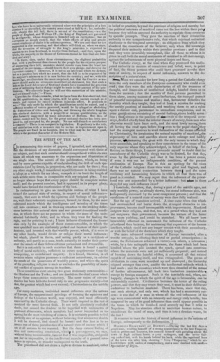
The Spirit of the Age, V [Part 1] Examiner , 15 May, 1831, p. 307 Somerville College Library