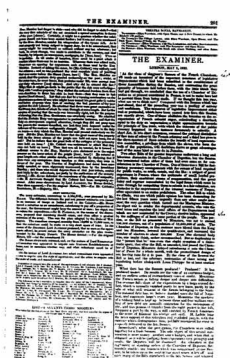
French News [78] Examiner, 5 May 1833, p. 281 Somerville College Library