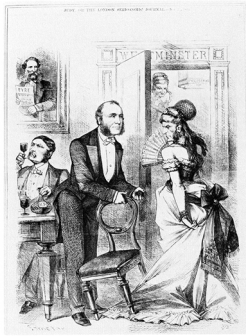
"Miss Mill joins the ladies" Judy , 25 November, 1868, pp. 46-7