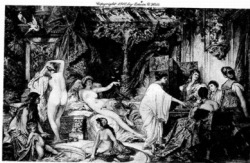
Summer. From painting by J.M.W. Turner.

“As when an apple, sent by a lover secretly to his mistress, falls from the chaste virgin’s bosom, where she had quite forgotten it; when, starting at her mother’s coming in, it is shaken out and rolls over the floor before her eyes, a conscious blush covers her face.”