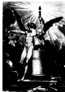
Allegorical bust of Voltaire.

That would also be for His glory. However, I conjure you to keep my secret, and save me from the honor and happiness of martyrdom.